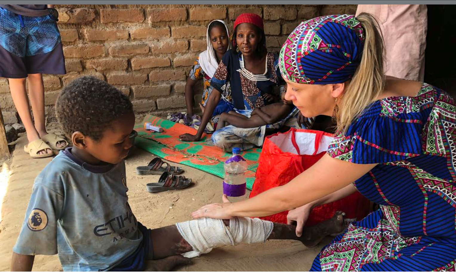
Sonja N. showing the love of Christ in Chad, Africa.