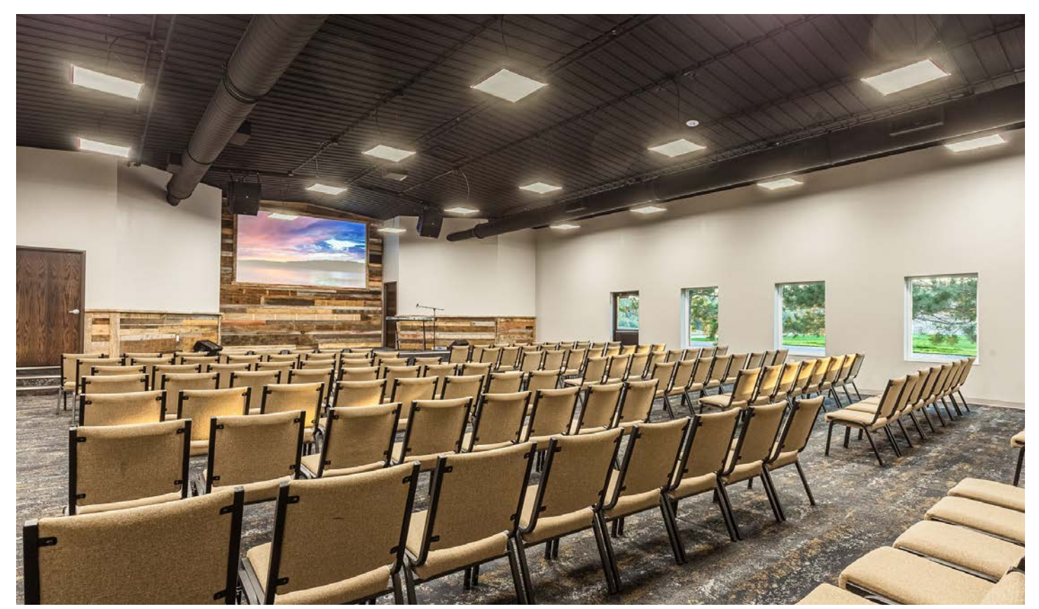
Inspiration Point at Twin Oaks.