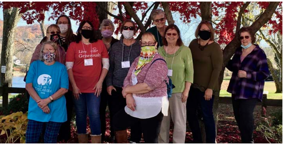
The Fall Women's Retreat at Tuscarora Inn & Conference Center.

Just prior to the start of the pandemic, the Lord led me to accept a position on the board of the Eastern Region Women's Ministry of the CLB. Our biggest job during the year is to plan the Fall Women's Retreat at Tuscarora Inn & Conference Center. How interesting that the theme God had put on our hearts for the retreat was, Resting in God in a Restless World! Our first planning meeting of the year... cancelled. Let the battle begin! We pushed on. We scheduled all subsequent monthly meetings via Zoom. We decided early on that we would plan the in-person retreat, pray, and let God take care of the